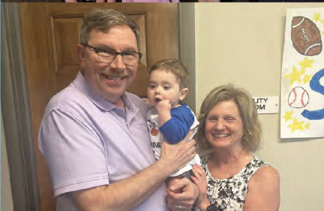
Grandpa and Grandma