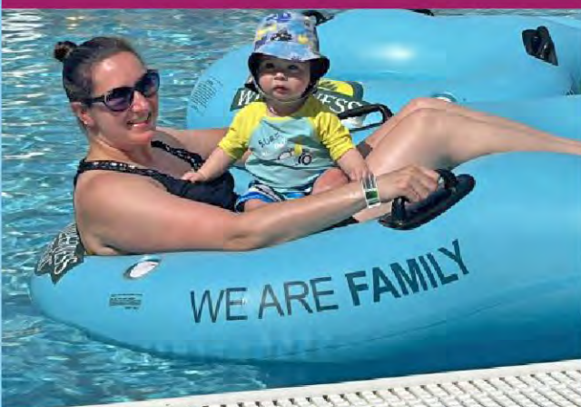
My Aunt and Godmother