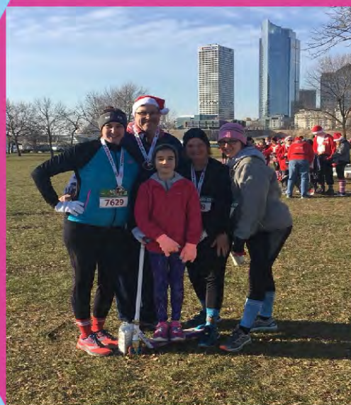
A community run